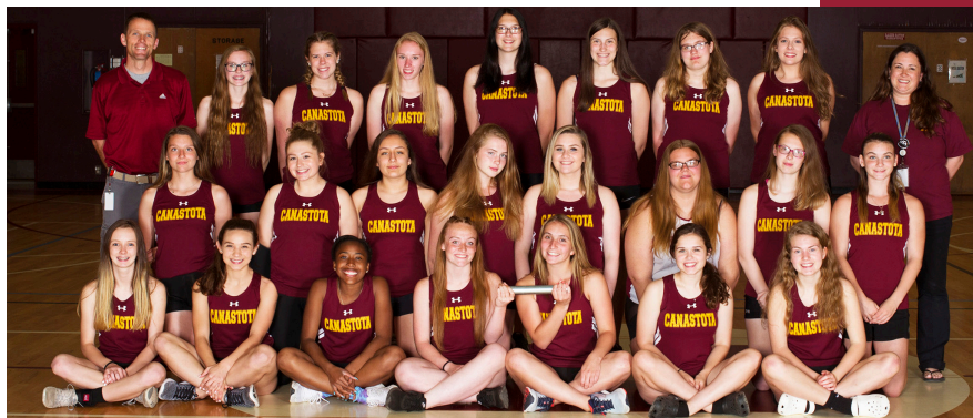
Varsity Girls Track