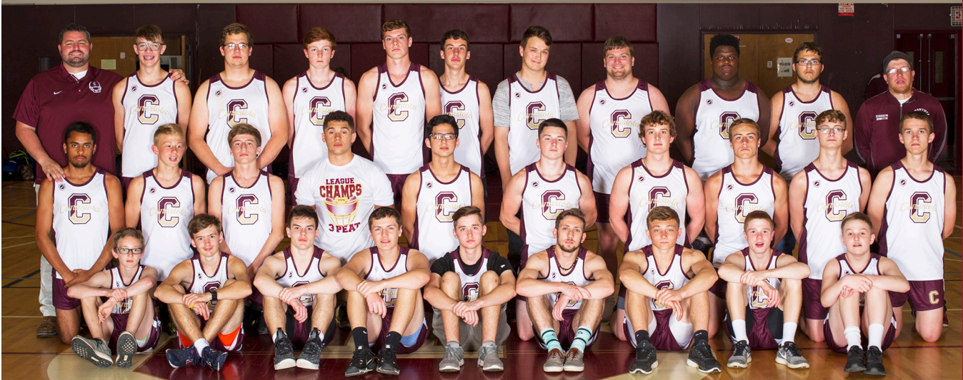
Varsity Boys Track